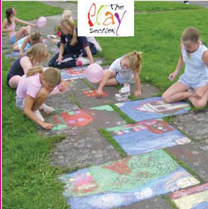
Pavement art on Play Day at Norley Hall

revised, new performance management systems have been introduced and, significantly, culture and quality of life now feature more prominently in corporate strategic thinking. The value of culture is more readily acknowledged and prominently reflected in Local Strategic Partnership work than before. Nationally, guidance has been issued on the integration of Community Plans and Cultural Strategies (following on from the Local Government Act of 2002), and this has been taken-up in the Borough's new Community Plan set for formal launch this year. The emphasis is on improving the quality and range of facilities and opportunities with a view to increasing participation.