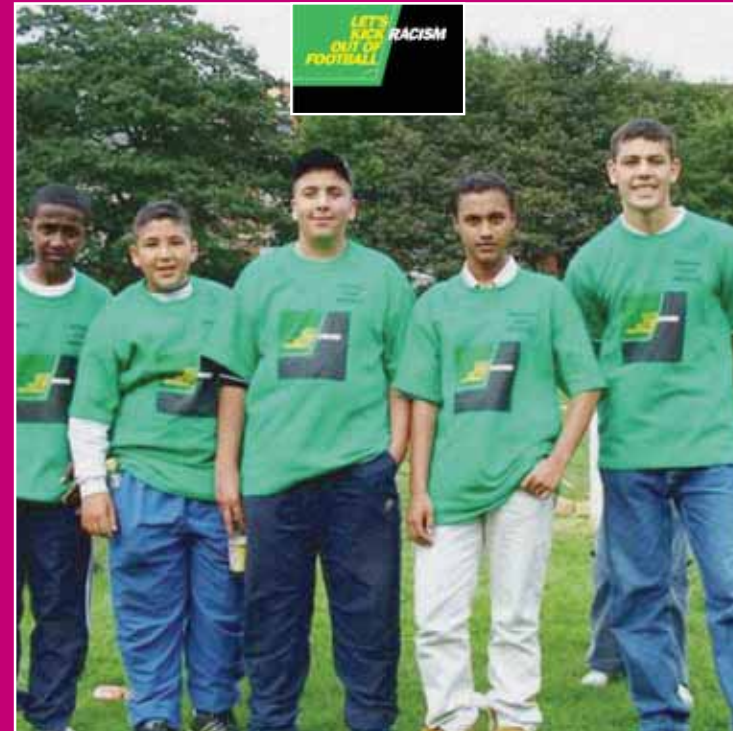
Multi-cultural teams participate in a five-a-side football festival at the annual Wigan One World event – in support of the Kick Racism Out of Football campaign and community cohesion works more generally