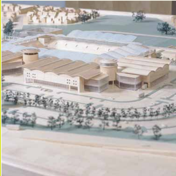
Leigh Sports Village: A £78 million investment in sport and educational facilities for the Borough

There are 3 priorities underpinning the vision: