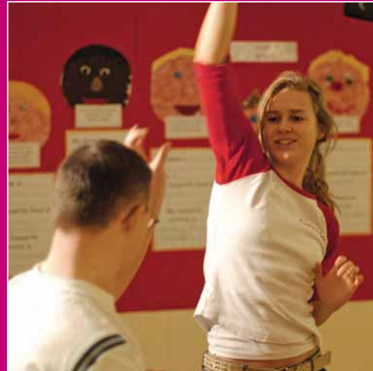
Developing inclusive dance programmes for young people within the Borough