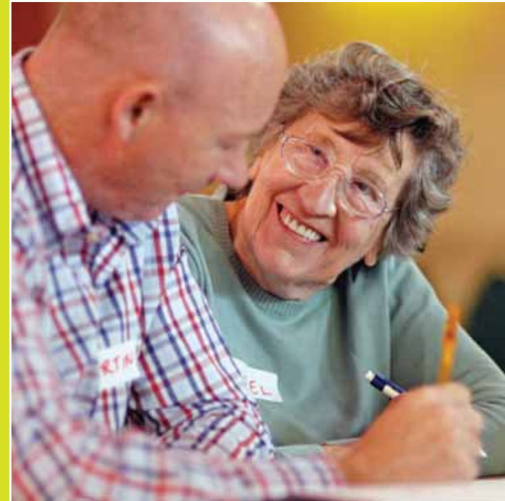
The spirit of partnership: an officer and community representative work together on the new Cultural Manifesto

Since the introduction of Northern Soul in 2001 the cultural landscape has changed quite significantly. Locally the WLCT has been established, some services have been