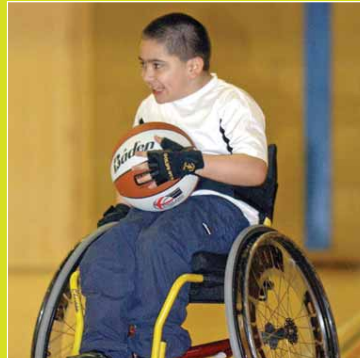
Wheelchair basketball at Robin Park through which new opportunities for participation are extended to disabled young people as part of a wider disability sports development programme across the Borough