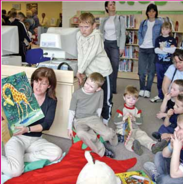
The newly refurbished Golborne Library is opened for all to 'explore' and enjoy